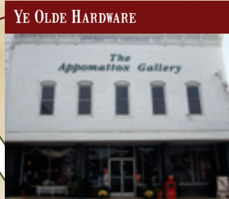
YE OLDE HARDWARE