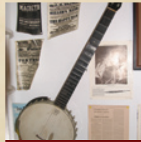
THE SWEENEY STORY

Appomattox Court House National Historical Park